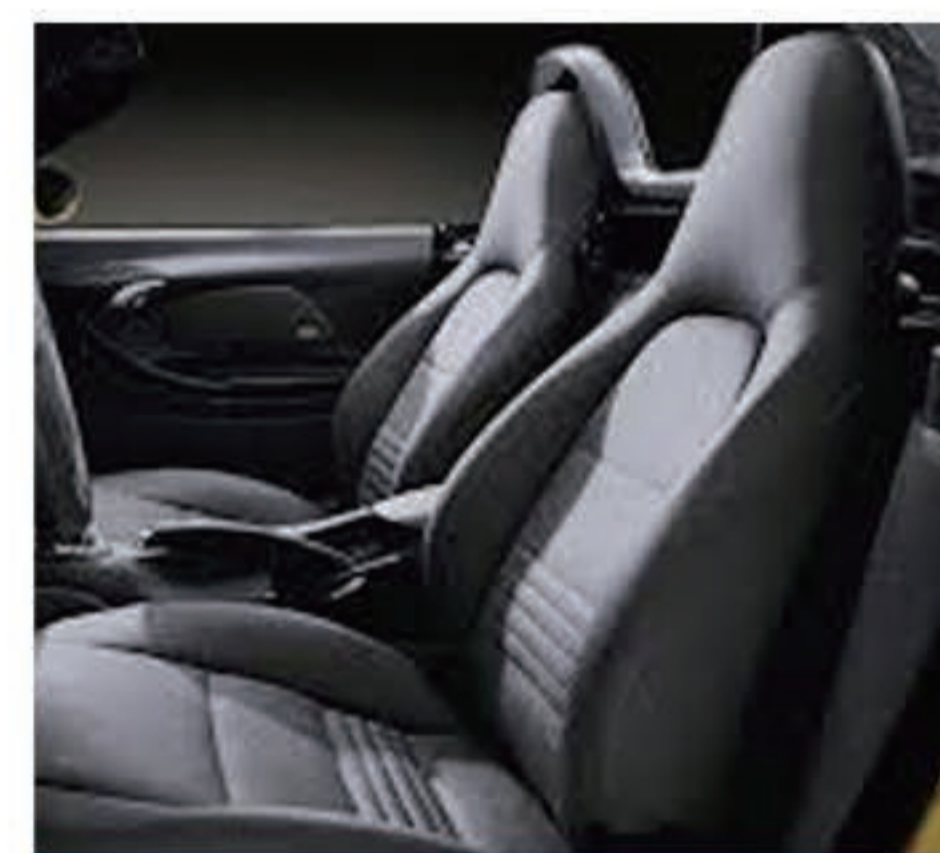
Mounting Leather Products